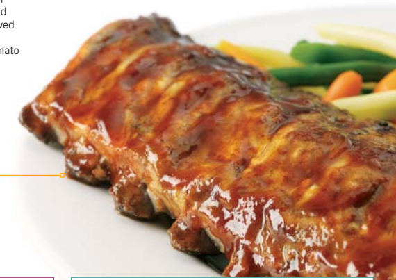
Slow-Roasted Pork Back Ribs

🍷 Chicken Parmesan A tender chicken breast breaded and fried until golden brown. Topped with pomodoro sauce and pizza mozzarella then baked to perfection. Served with your choice of side dish and garlic toast. Garden greens with our signature sun-dried tomato balsamic vinaigrette to start. $16.49