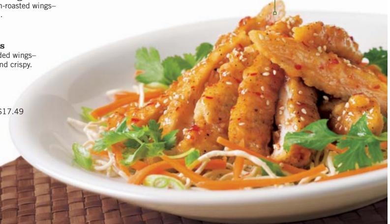
Thai Chicken Bites

Double order. Choose two of your favourite flavours! $17.49